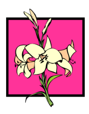
May 15, 2022 Order of Service - 10:00 am