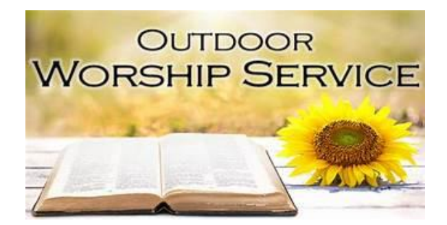
May 29 thru September 4, 2022 9 AM

To learn more about Mental Health Awareness Month, you can visit: <u>https://www.mhanational.org/mental-health-month</u>